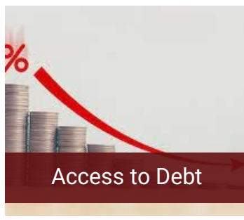
Access to Debt